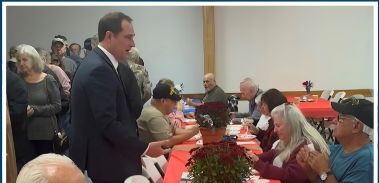
It is always an honor to recognize area veterans at our annual Veterans Breakfast. We are so blessed by their service.